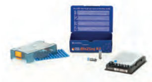
Mix2Seq Kit - OVERNIGHT